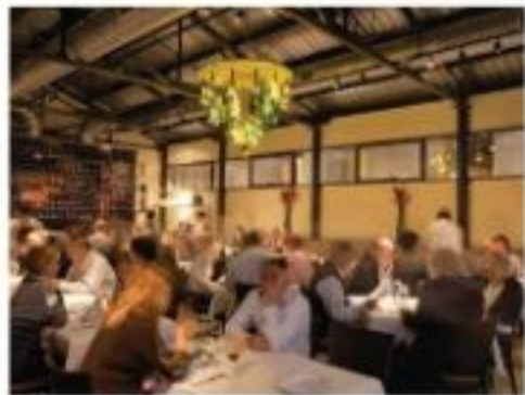
SMOKIN' CUBAN Above, clockwise from top: San Antonio's Cuba-chic Hotel Havana, which has expanded its buzzy new lounge and restaurant called Ocho; Il Sogno at the Pearl Brewery; and the Mokara's spa