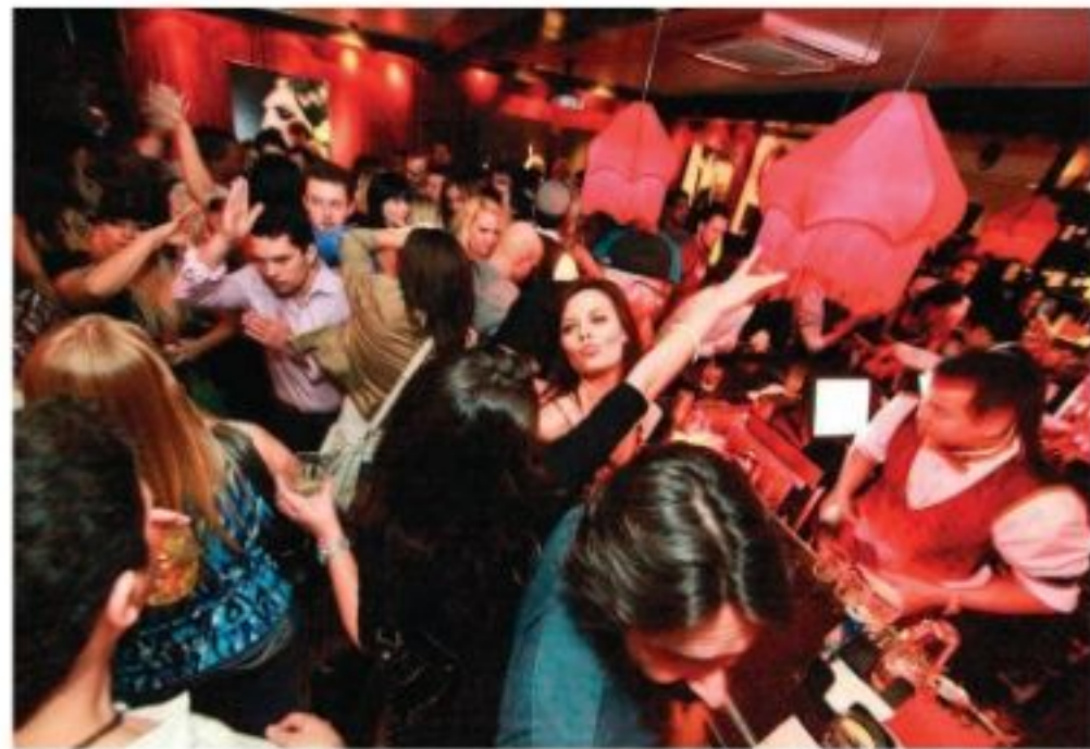
DALLAS STARS From top: the revamped Dragonfly restaurant at Hotel ZaZa, a Prohibition-era cocktail at new Cedars Social, and party time at Sfuzzi pizzeria in Uptown, whose raucous brunch is a must-hit.