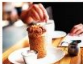
CAPTA (EW) Above, clockwise from top: Washington, D.C. based in a soup can at Foreign & Domestic, and Congress; W, left and below; The W's adjoining Moody Theater and its Secret Bar.

and wood get hipped up with colorful rugs and accents bursts to life. There's great music—the hotel-wide sound system is epic, and the always mood-appropriate funky-hipster music library is enormous—and a lively crowd of pretty people. Guests sipping vodka-spiked cucumber-alopeto kombucha, most of them appearing to be slightly dressed-down fashion models, move toward through several intimate parlors, to the windowless, red-lit Secret Bar . Bar-hoppers and concertgoers spilling out of the adjoining new Moody Theater who might be up for an artisan-cocktail nightcap in a pubby restaurant bar—one that makes you imagine rained-out scenesters taking over a pheasant-hunting club—should jump into one of the rickshaws lined up outside and take a beery ride to new Haddingtons (601 W. 6th St., 512.992.0204).