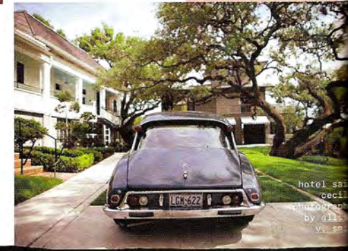
hotel san cecilia

SAINT CECILIA 112 ACADEMY DR. San José's demure little sister is located on a more tranquil side street. With its suburban lawn and cozy rooms, it kind of feels like you're staying in your friend's charming house (if your friend's house also had a moody bar downstairs). hotelstcecilia.com