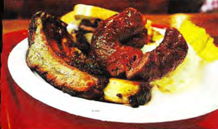
the barbecue sampler at ironworks

AUSTINIST.COM RECOMMENDS: El Reggino makes the most delicious chicken you will ever eat in your life. You give them $13 and they hand you a bag of roasted chicken and green sauce.